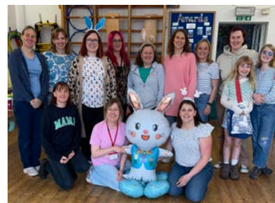
Some of the CISA team at Easter!